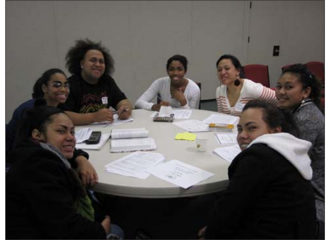
Young leaders from Genesis UMC shared a table with area youth.