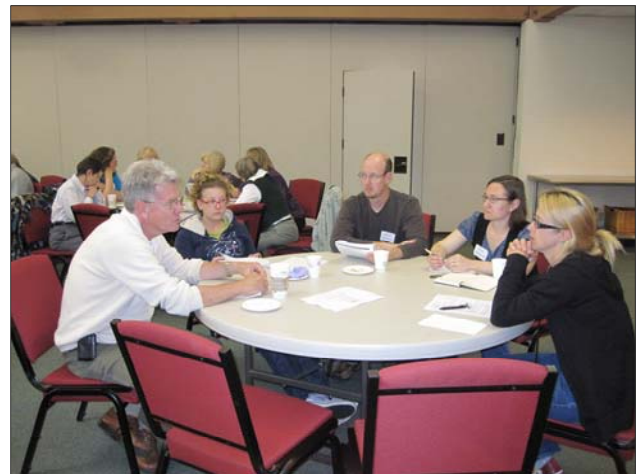
Clergy, youth directors, and church members exchanged ideas and experiences for meaningful youth ministry.