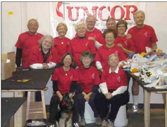
The San Jose District UMVIM Team, above, takes a break from assembling kits at the Salt Lake City UMCOR Depot.

A San Jose District Volunteers in Mission team traveled to the Salt Lake City UMCOR Supply Depot and served from April 5-9, 2010. The team transported several hundred health kits and supplies. The San Jose VIM team, along with a couple from Modesto and a Denver, Colorado VIM team, processed and repackaged over 14,000 health kits.